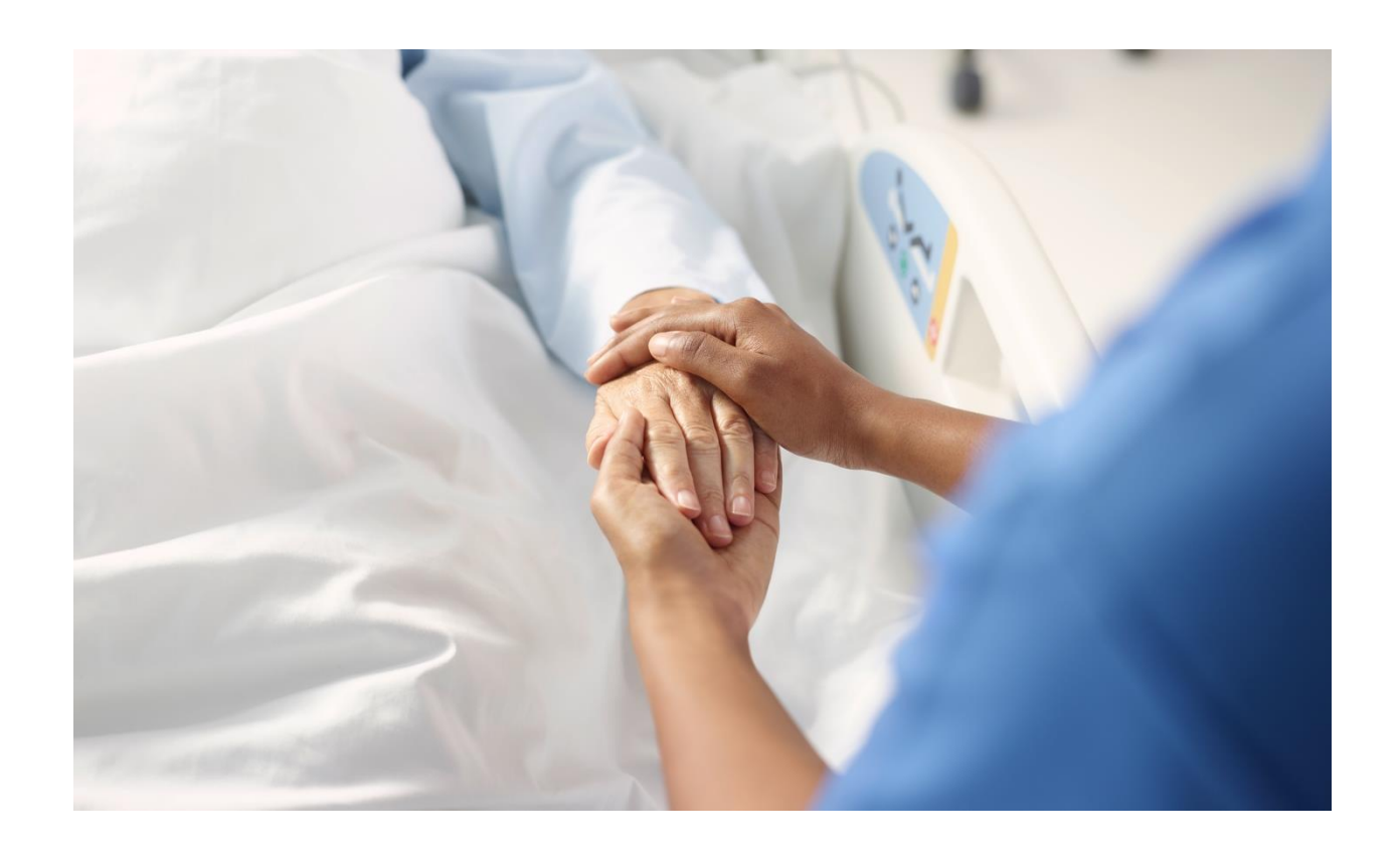
Human Rights Statement